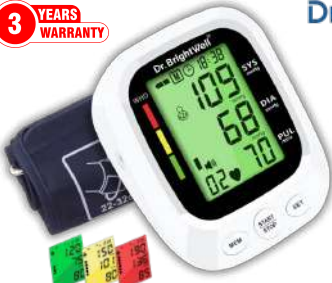
Tri-Color Dynamic Display

Dr. BrightWell ® EASYTRACK Healthcare M M